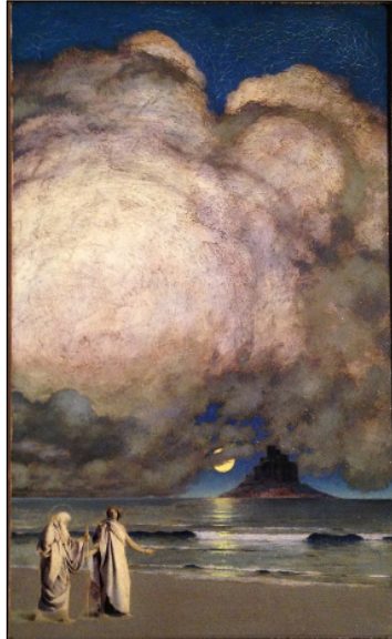
Maxfield Parrish (1870–1966), "Twilight Had Fallen Before the Stranger Rose," 1901, oil on panel, 11 5 / 8 by 7 1 / 4 inches, "Phoebus on Halzaphron" by Arthur Quiller-Couch, Scribner's Ma

The second of two Kennedy portraits, and actually the last portrait of President Kennedy completed by Rockwell for the Saturday Evening Post , this depiction reflects a strong, intelligent, experienced leader fight-