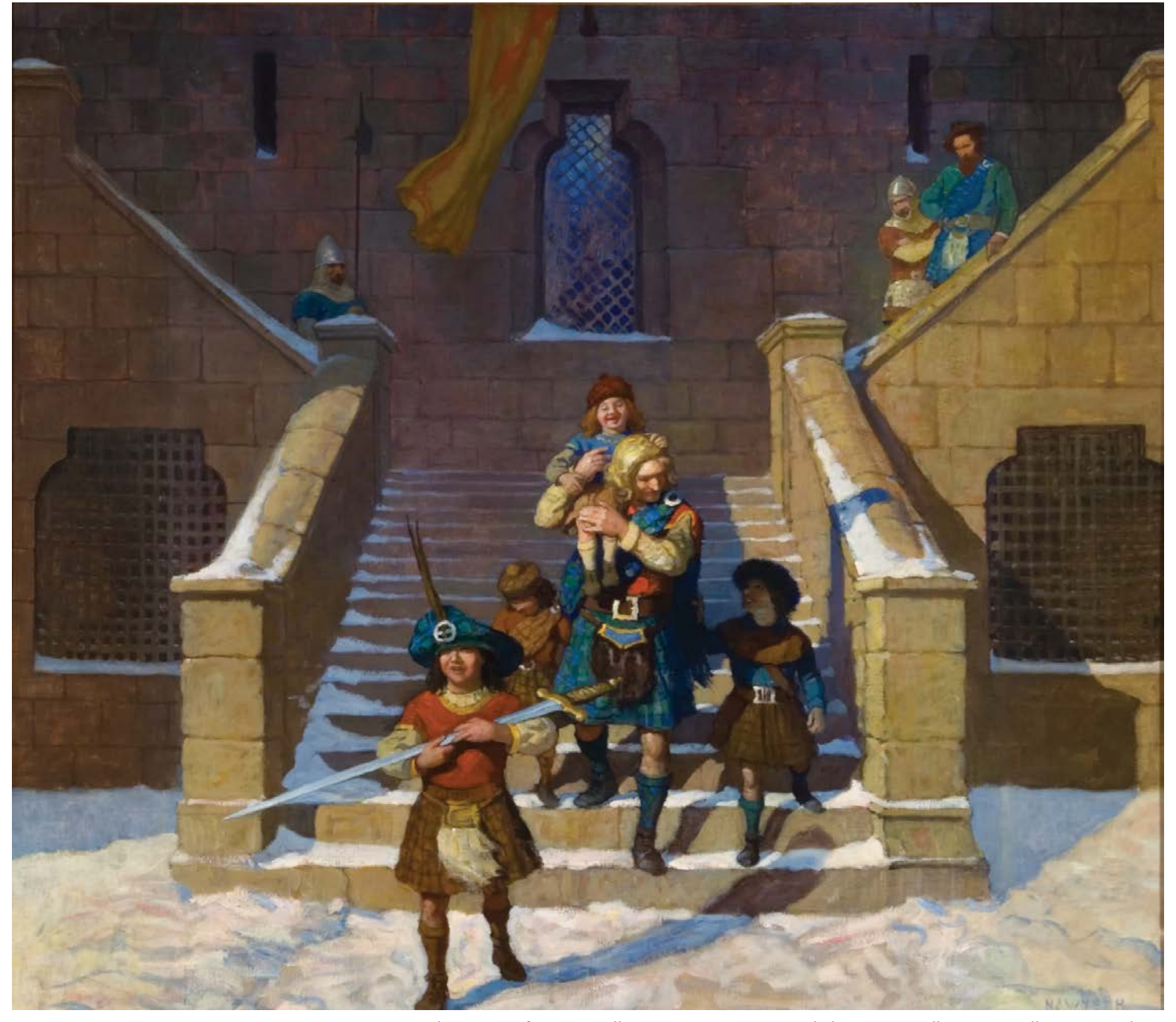
National Museum Of American Illustration, Newport, RI, And The American Illustrators Gallery, New York, NY

Book illustrator N.C. Wyeth invigorated the pages of Scribner Classics like "Treasure Island" and "Robin Hood."