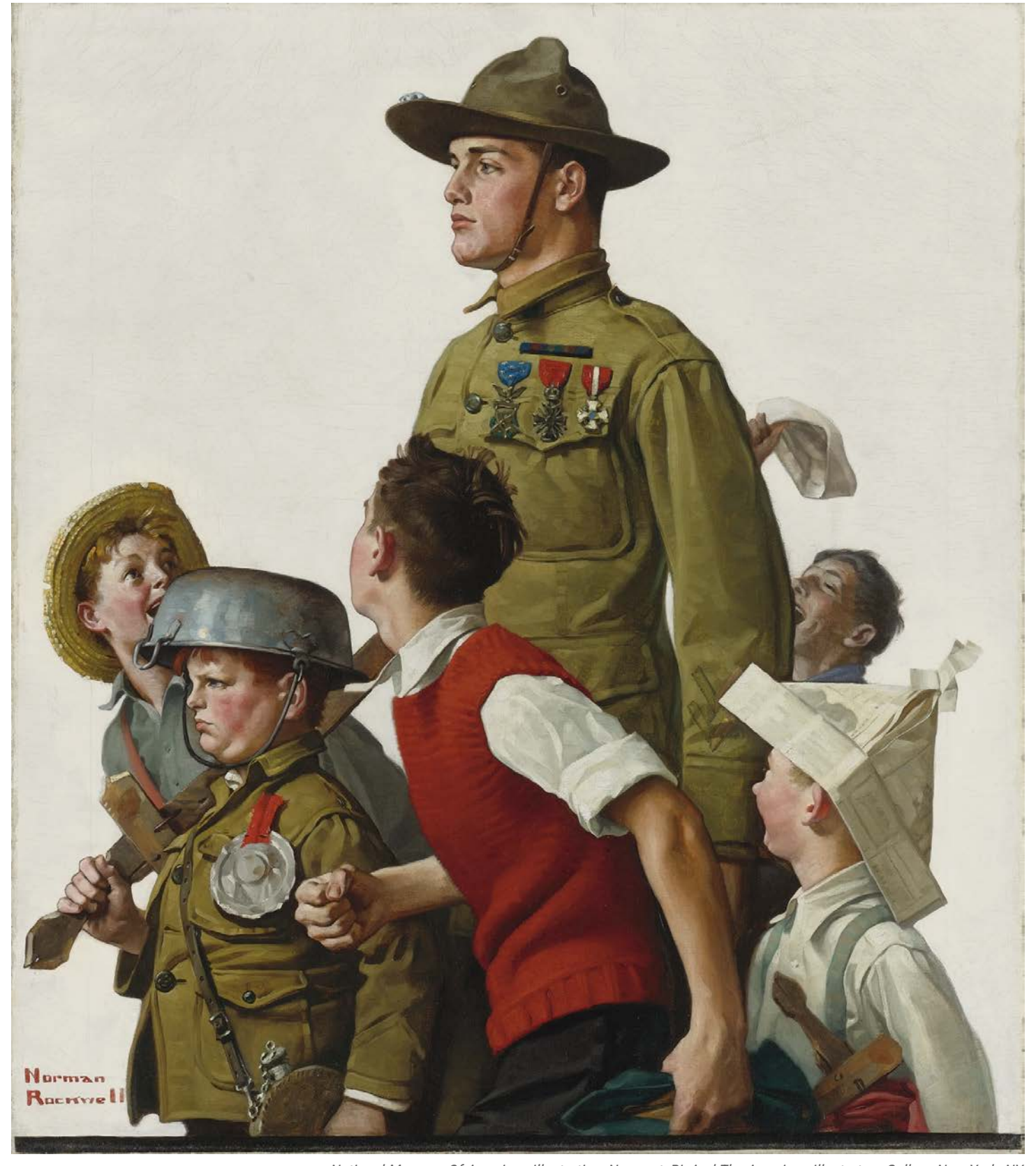
National Museum Of American Illustration, Newport, RI, And The American Illustrators Gallery, New York, NY.

Norman Rockwell, 'The Doughboy and His Admirers,' 1919, Oil on canvas.