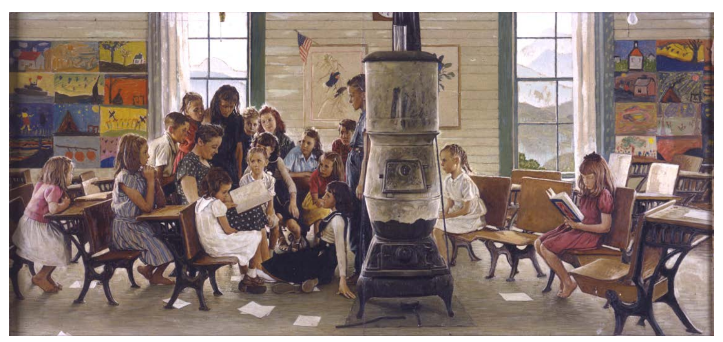
National Museum Of American Illustration, Newport, RI, And The American Illustrators Gallery, New York, NY.

A prolific artist, Norman Rockwell created more than 300 covers for The Saturday Evening Post, in addition to illustrating advertisements and books.